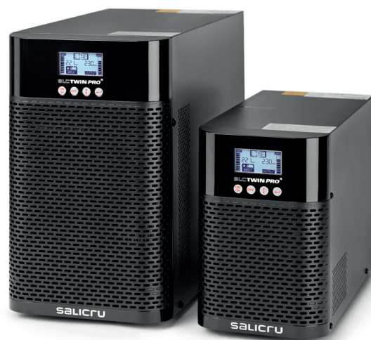
SLC TWIN PRO2