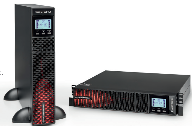
SPS ADVANCE RT2